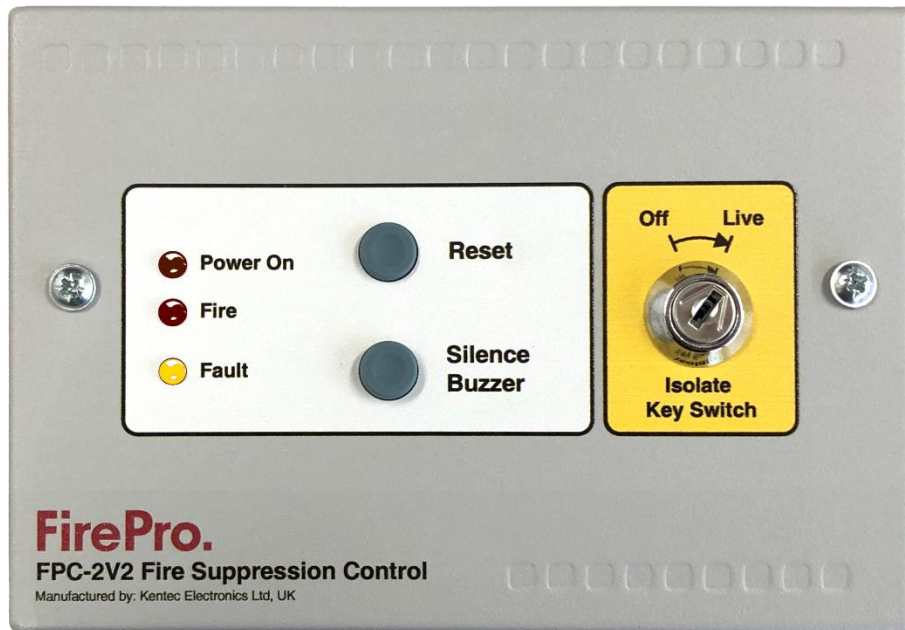
Fire Control Panel for FirePro Aerosol Systems