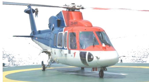
Ideal for Helideck's