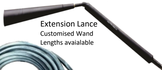
Extension Lance Customised Wand Lengths available