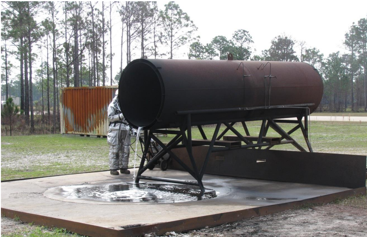
Figure 3. The F-100 Nacelle Mock-Up Used for Rear Engine Testing and Access Panel Testing. In This Photo, Fuel is Flowing through the Nacelle in Preparation for a Rear Engine Test

Rear engine fire tests and access panel fire tests were performed using the F-100 nacelle test fixture located at the Silver Flag test site (Figure 3). The fixture is a cylinder 16 ft long that contains an inner cylinder (the space between the cylinders is termed the annulus) and three baffles positioned along the inside of the inner cylinder. The fixture is equipped with three spray nozzles that allow fuel to flow into different regions of the nacelle to simulate different fire scenarios. The nacelle sits atop a concave concrete pad that can collect a pool of jet fuel as part of the fire scenario. Design details and test protocol using this fixture are described in AFRL-ML-TY-TR-02-4540 (4) and AFRL-ML-TY-TR-2002-4604 (8).