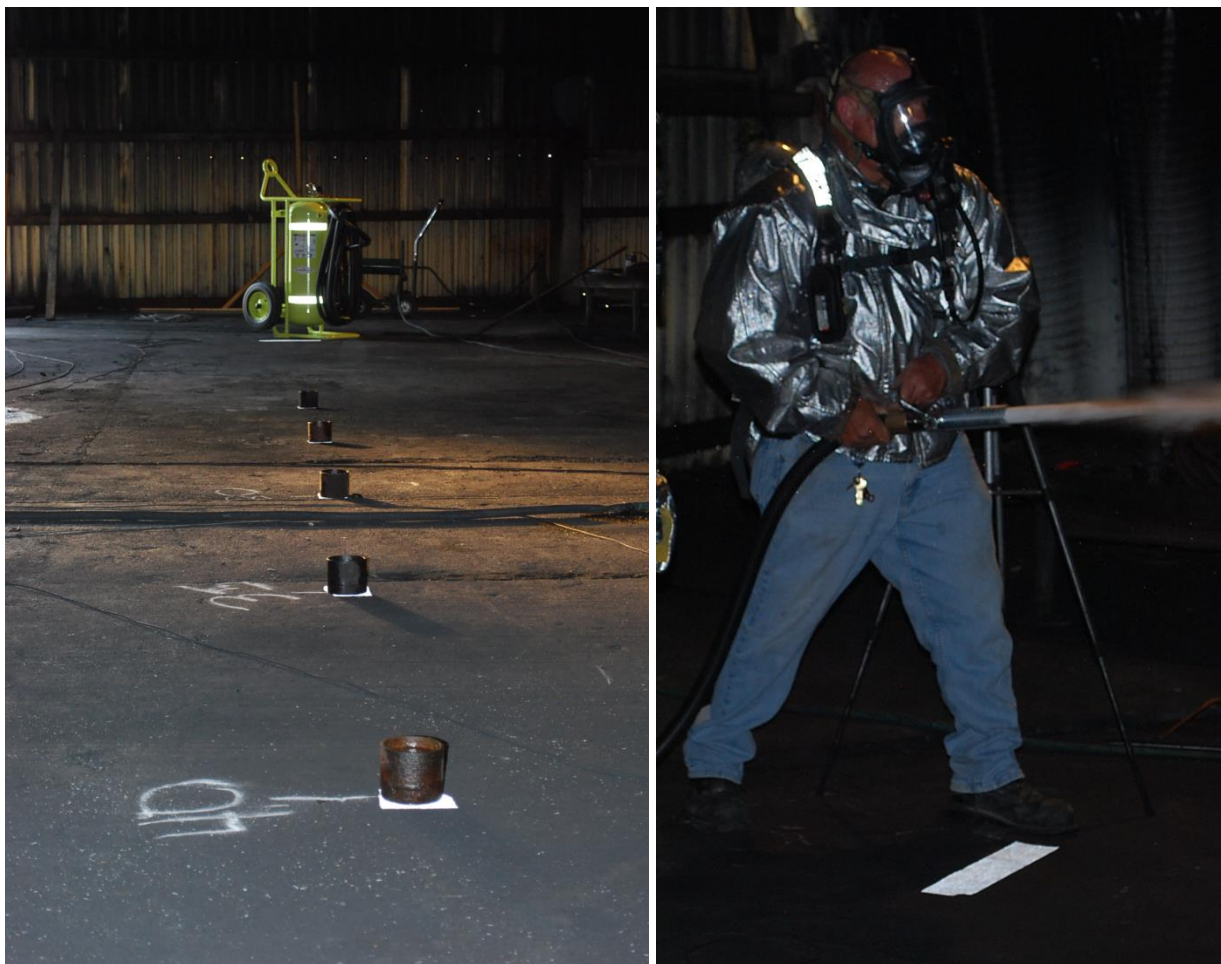
Figure 8. Fuel Cups Positioned At 5-ft Intervals from the Amerex Extinguisher (Background) (left); Firefighter Discharges the Extinguisher into/over the Cups (right)