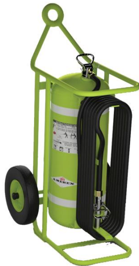
Figure 2. Amerex Model 775 Wheeled Fire Extinguisher

The model 775 is 3 in taller, 4 in deeper and 40 lb heavier than the model 600. Both extinguishers hold 150 lb of their respective agent. Both extinguishers are pressurized with nitrogen to expel their extinguishing agent, the model 775 operating at 125 psi compared to the Halon 1211 extinguisher operating at 200 psi. The model 775 has a 40-ft long, 1-in hose, which is somewhat shorter than the 50-ft long, ¾-in hose on the Halon 1211 extinguisher. The listed discharge range for the model 775 is 30 ft, whereas the Halon 1211 extinguisher range is given as being 30–40 ft. The listed discharge time for the model 775 is 22 s, giving it an average discharge rate of 6.8 lb/s (compared to 40 s and 3.1 lb/s for the Halon 1211 extinguisher). The model 775 extinguisher has a 3A:80B:C rating from UL based on UL Standard 711 (3).