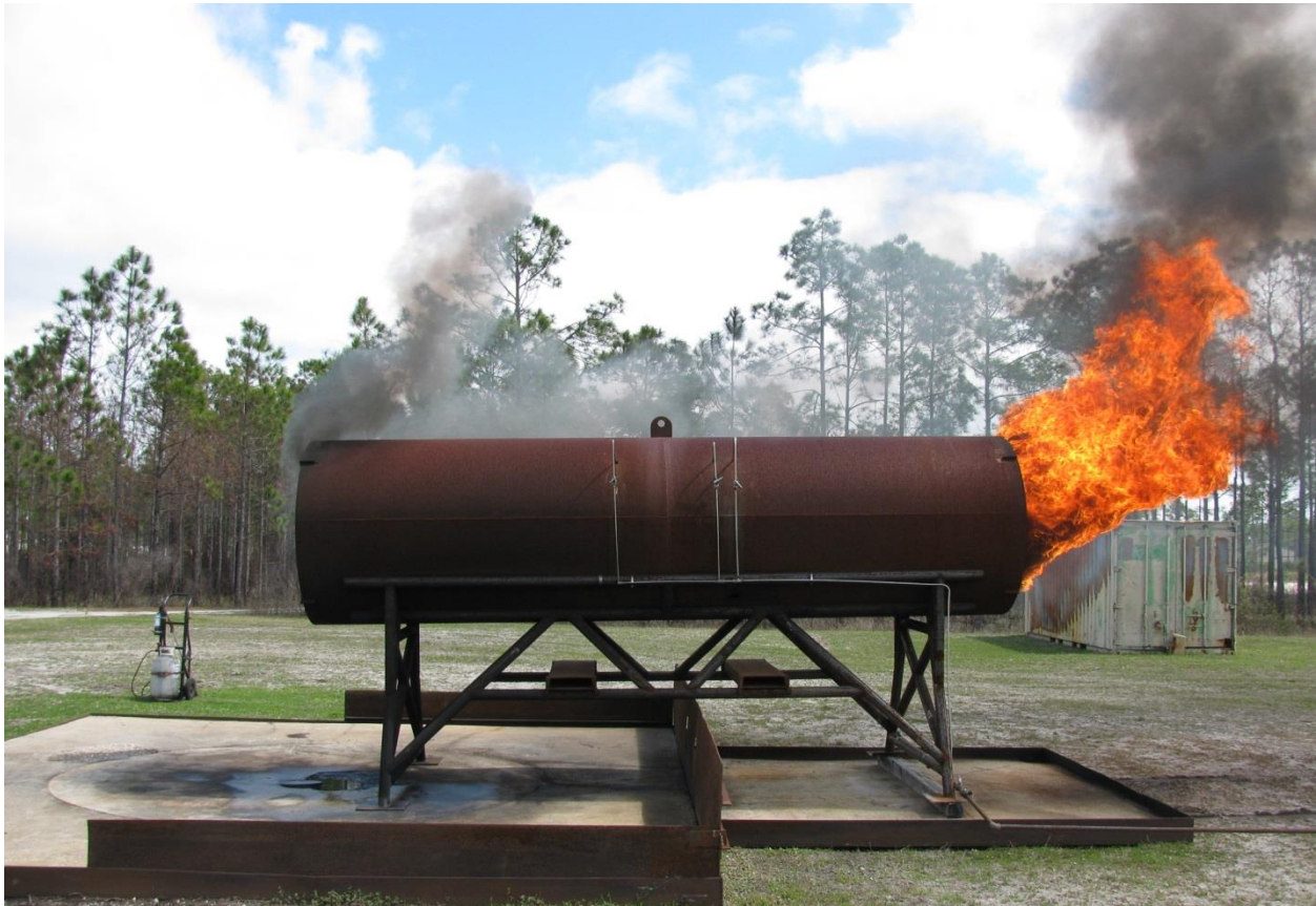
Figure 5. The F-100 Nacelle Mockup during the Pre-Burn Phase of a Rear Engine Fire Test