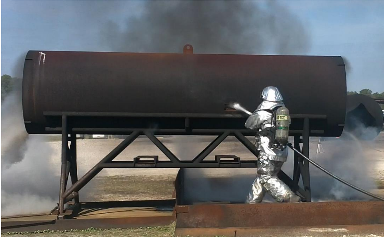
Figure 7. A Firefighter Applying Agent Through the Side Panel of the F-100 Mockup during an Access Panel Fire Test