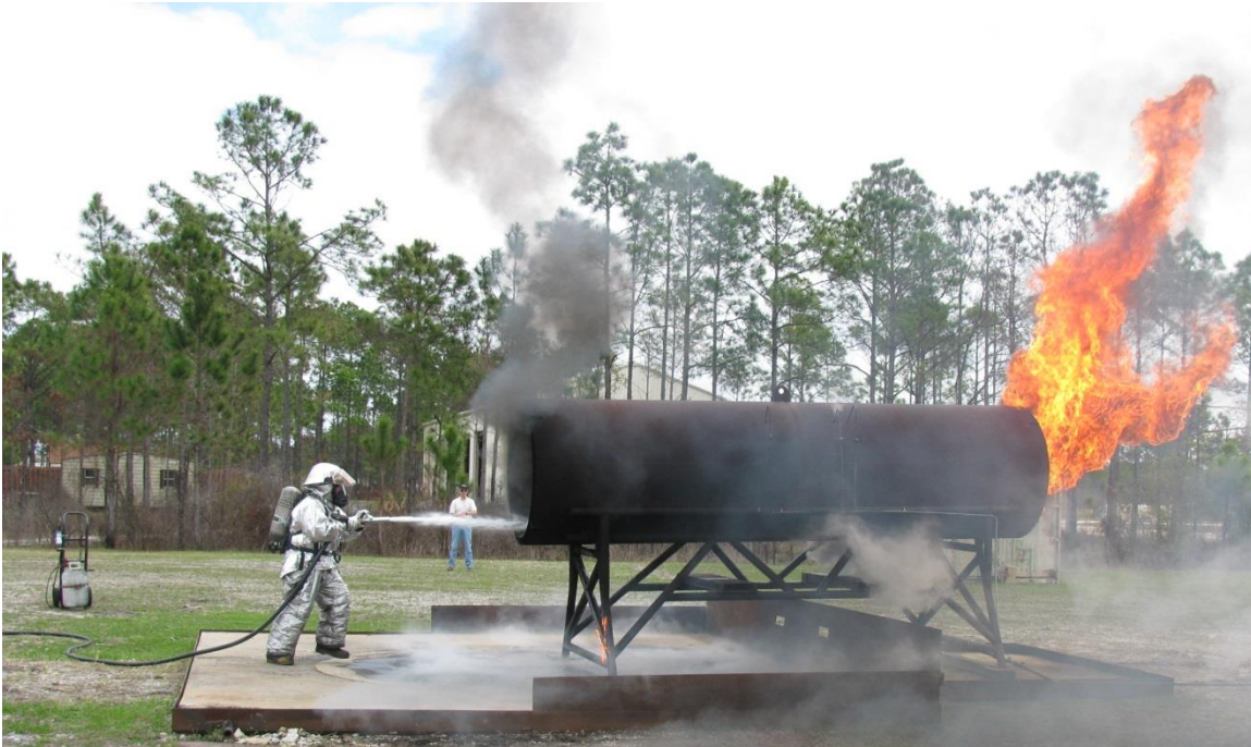
Figure 6. A Firefighter Applying Agent into the F-100 Nacelle Mockup during a Rear Engine Fire Test