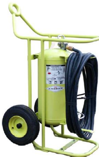
Figure 1. Amerex Model 600 DOD Halon 1211 Flightline Extinguisher

The existing Halon 1211 flightline extinguishers were procured by DOD using a purchase description prepared by Warner Robins ALC (2). Figure 1 shows the current unit.