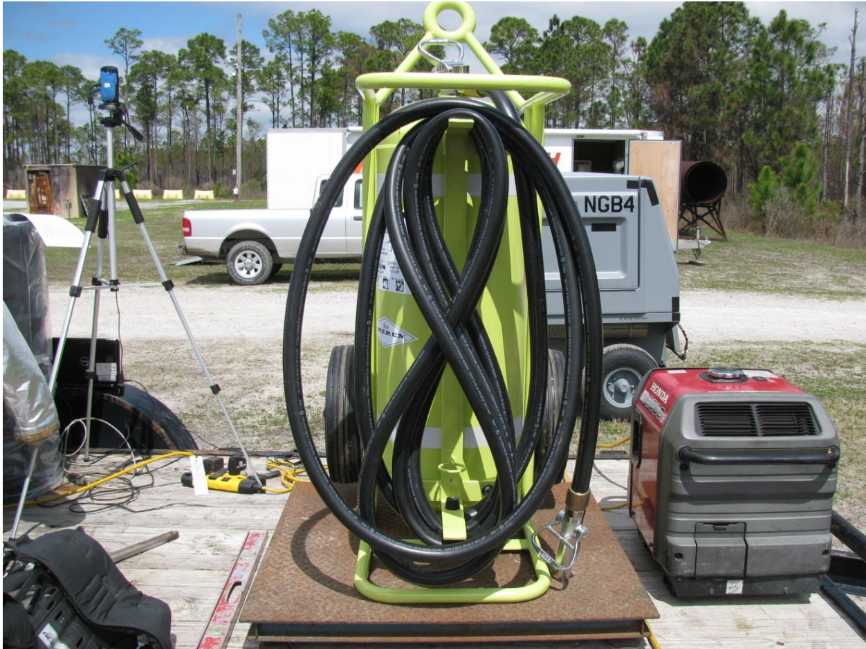
Figure 4. The Amerex 775 Extinguisher Resting on a Scale during Preparations for a Rear Engine Test

Two tripod-mounted video cameras were set up to record each test from two different angles. A tripod-mounted Kestrel weather meter was also used to monitor the ambient temperature, humidity, and wind speed and direction. Testing was performed only when wind speed was 8 mph or less. The extinguisher and nacelle were positioned so that the wind direction was from the firefighters' back and towards the nacelle, plus or minus 30 degrees.