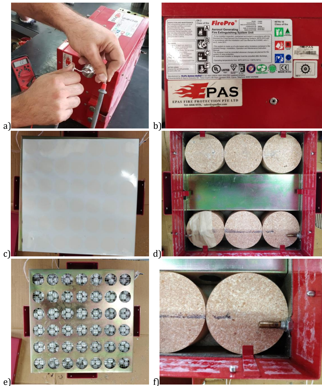
Figure 2: (a-b)FP-2000 generator, (c-f) FP-2000 disassembled internal housing.

The FP-2000 condensed aerosol generator was disassembled, Figure 2, with the findings suggesting zero environmental factor effect on the generator components and compound.