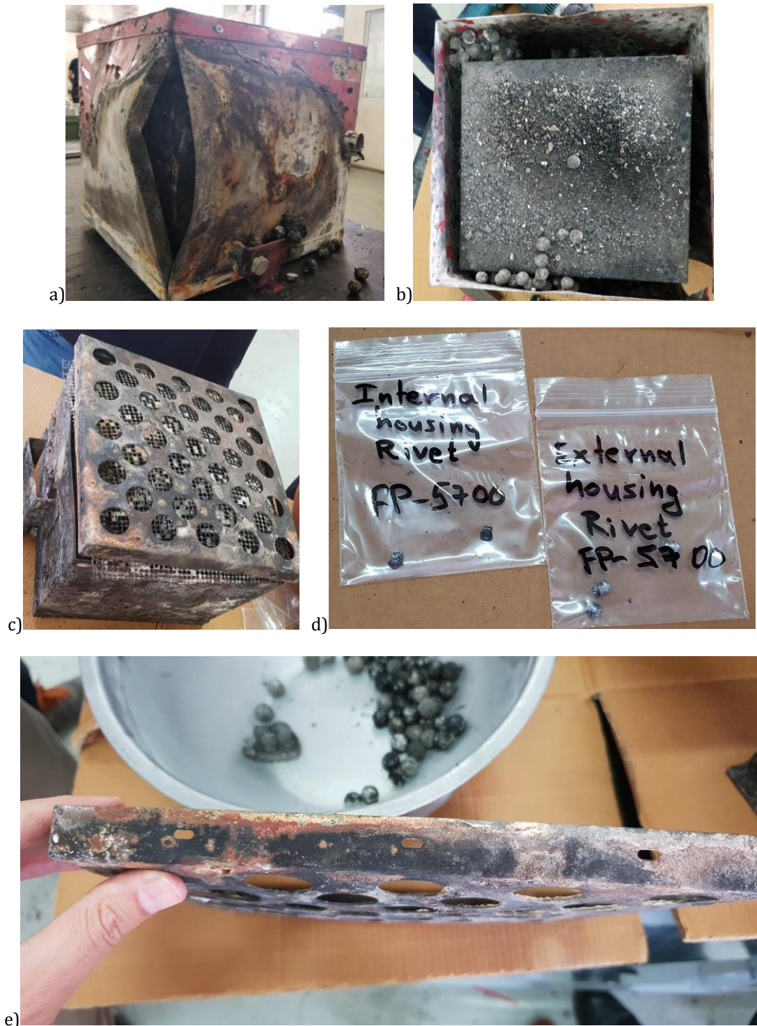
Figure 1: FP-5700 in-service malfunction; a) Deformed external housing, b) Cooling material observed in the aerosol exit path, c) Internal housing failure, d) Internal and external rivet samples, e) slots on internal housing's plate indicating that there was no resistance from the rivets prior to the plate being detached.