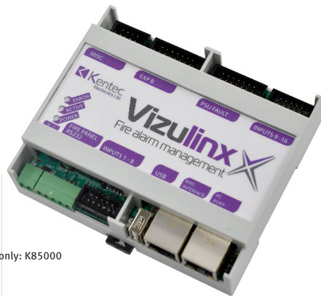
Module only: K85000