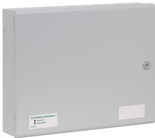
Housed version: K85000 M2

Provides building managers & service organizations instant updates on any faults & fire alarm activity, thus providing convenience and time-saving efficiencies.